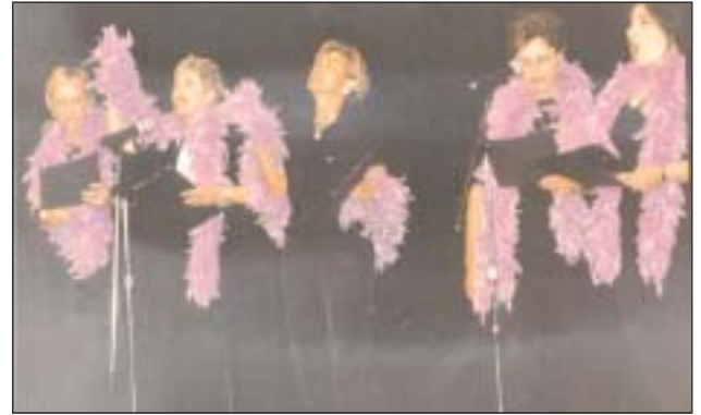
Above, the ThunderDivas perform for their devoted fans.