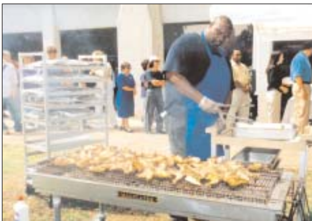
Left, Food Services cooked a feast of barbecue chicken and all the trimmings.