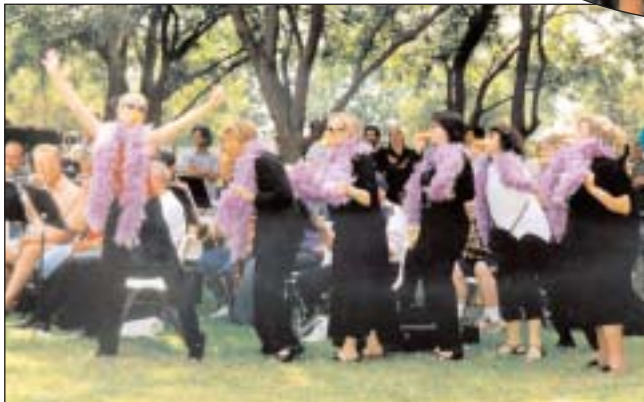
Left, the Thunderdivas put on a rousing performance.