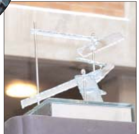
Right, a model of the sculpture by Bill Meek that will be in the atrium of Thunderduck Hall is displayed.