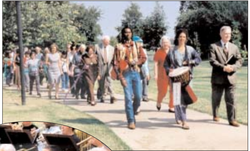
Above, those gathered for the event walk the peace pole trail on their way to Thunderduck Hall.